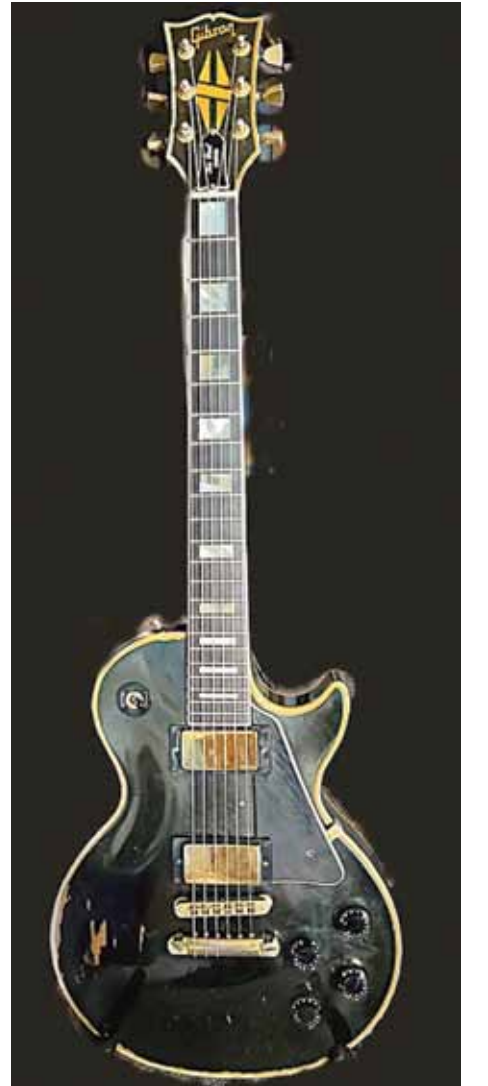
Blackie as she appears after 37 years and two fret jobs. She's got some wear & tear but she's built like a tank.

Speaking of hand jobs, I've been informed that the dreaded arthritis is increasing hand issues. It used to mainly affect my fret hand but now it has invaded my picking hand. My mother had terrible rheumatism. Could also be the side effects of the different old people medications the doctors prescribe. I much prefer young people drugs... they're a lot more fun (just like having a young body is).