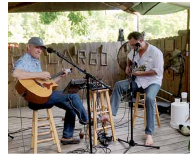
More music at the Moose!