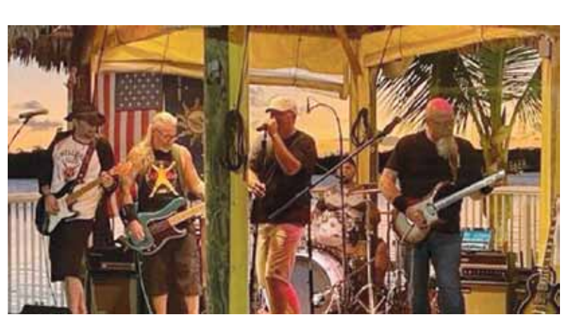
RearViewMirror at the Lorelei.