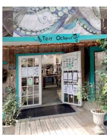
The Tipsy Octopus!