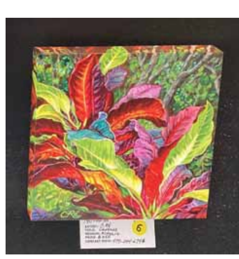
The AGPI 2023 People's Choice Winner is "Crotons" by C Ré.