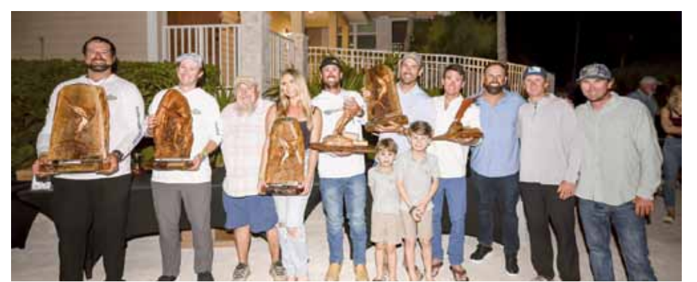
Congrats to the 1st Place team "Hillbilly Deluxe' in the Cheeca Presidential Tournament in late January.