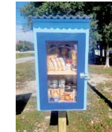
Moose food pantry box to assist our community with non perishable foods! Located in the southbound parking lot at MM 98.8! Anyone can help themselves or add to it!