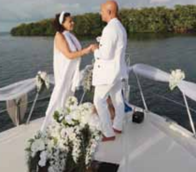
Boarding in Islamorada

Sunrise & Sunset Wedding even more memorable. "We look forward to our next outing with you both. Once again thank you for making our wedding amazing!"