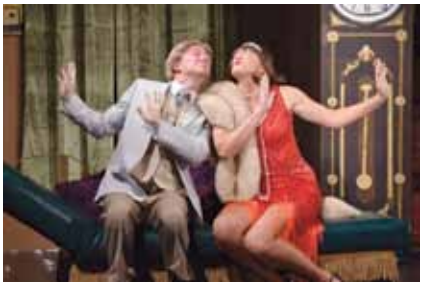
Are they having an affair?

A talented Cast of nine takes on multiple roles to bring a zany cast of characters to this production. Even the Crew members step into some roles.