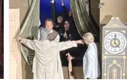
What is happening outside the window?

From Mischief, Broadway masters of comedy, comes the smash hit farce. Welcome to opening night of the Cornley University Drama Society's newest production, The Murder at Haversham Manor, where things are guickly going from bad to utterly disastrous. This 1920s whodunit has everything you never wanted in a show—an unconscious leading lady, a corpse that can't play dead, and actors who trip over everything (including their lines). Nevertheless, the accident-prone thespians battle against all odds to make it through to their final curtain call, with hilarious conseguences! Part Monty Python, part Sherlock Holmes, this Olivier Award-winning comedy (Best New Comedy) is a global phenomenon that's guaranteed to leave you aching with laughter!