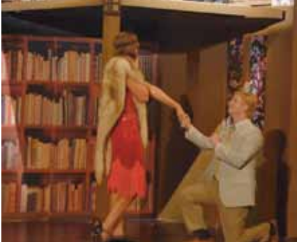
Maybe not dead?