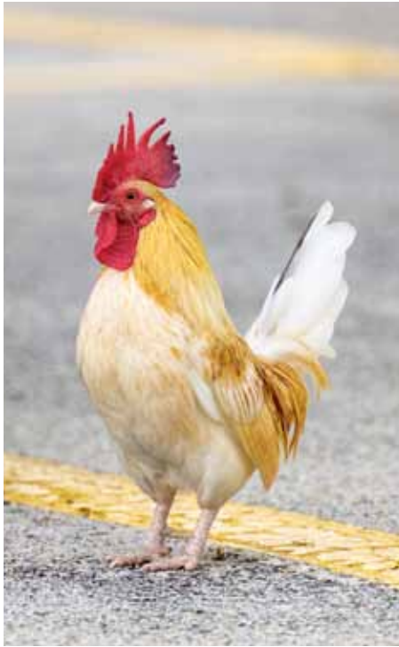
Chicken Crossing. Be prepared to stop and let the chicken cross the road.

aboard warships during WWI. These sailors must have adopted some of the traditions of the countries they were protecting. Cubans arriving in Key West fleeing a war brought with them their Cuban heritage, including their roosters and the sport of cockfighting.