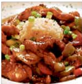
Kung Pao Bowl