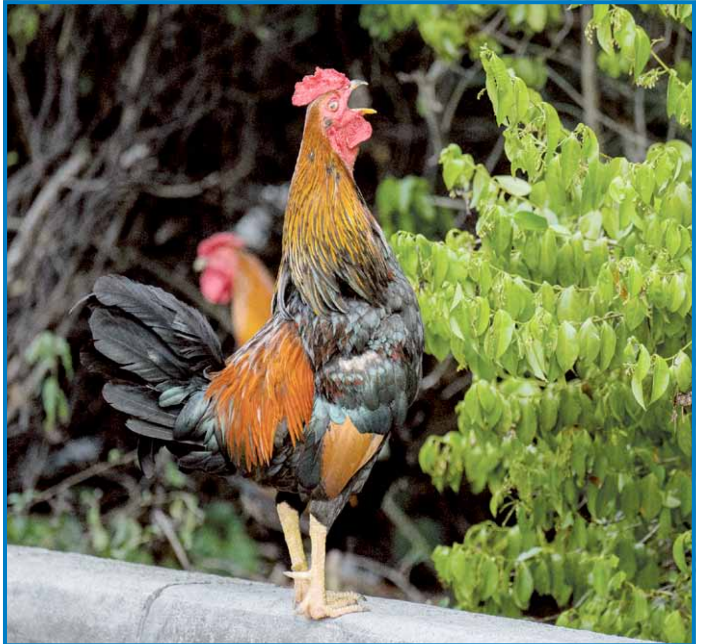
Rooster crows from its perch on the curb bordering the woods in Key Largo's Tradewinds Plaza. See her article on pages 4-5.