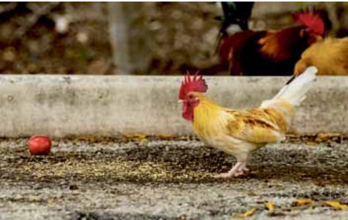
Chicken ( Gallus domesticus ). Chickens are attracted by the daily feeding.

obviously someone is feeding them. I suppose no-one is particularly bothered by the roosters' early morning crowing. I find them amusing and a small reminder of our early Caribbean island roots.