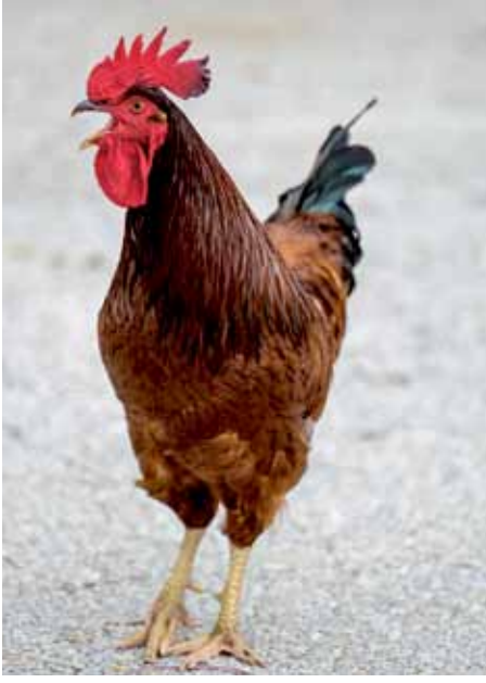
Many residents love the chickens, but would rather not deal with their loud crowing.

chicken, locals call their chickens "gypsy chickens"