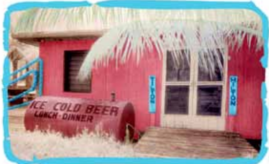
FRED'S TILTON HILTON - DOWNTOWN CARD SOUND ROAD

SPF 50, long sleeve, fishing performance shirt in aluminum, blue mist or white.