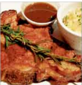
Prime Rib Dinner