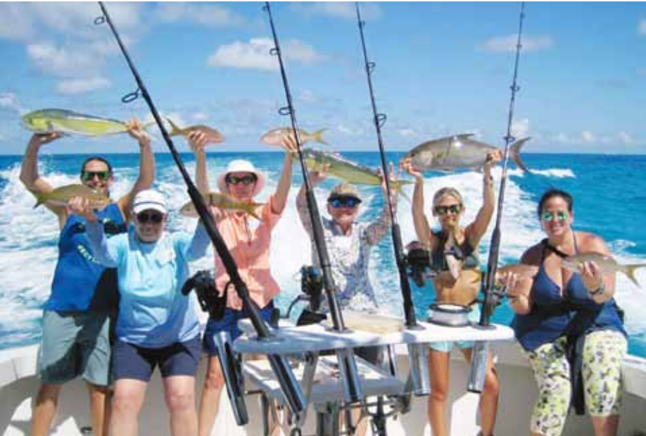
This data was based on the Special Report on Fishing, in partnership with the Outdoor Foundation and conducted by Southwick Associates, available at TakeMeFishing.Org/SpecialReport and NMMA www.nmma.org/press/article/24334 .

"People are still choosing to fish and boat. With a renewed focus on wellness, fishing and boating offer an accessible outlet for those looking to unplug, escape the stresses of everyday life, and spend more time with friends and family."