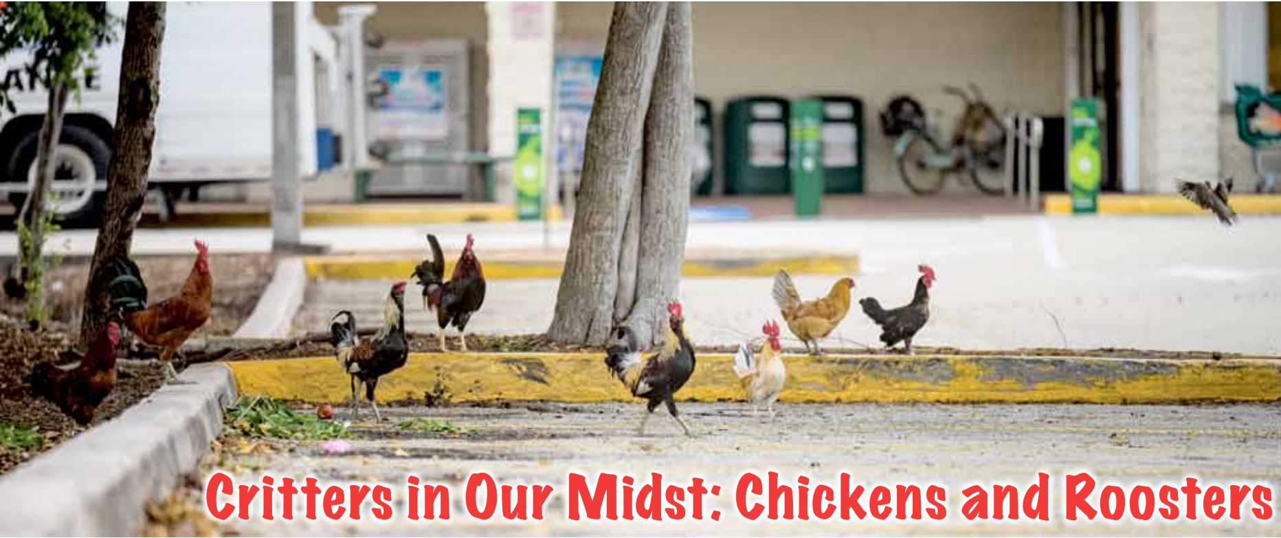
Early morning scene in the Publix parking lot at Tradewinds Plaza.