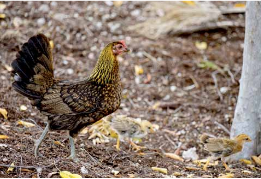
A hen and her chicks taking a stroll in the parking lot median strip.

Keys until it was outlawed in the 1970s; no longer being of use to their owners, these roosters were released into the streets of Key West.