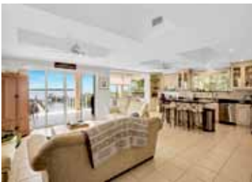
155 Atlantic Circle Drive, Key Largo

Ocean Front Home in Historic Old Tavernier with amazing ocean views. This home is extremely well built and maintained with about 2900 Sq ft, including downstairs. 3/2 with ceramic tile floors throughout, granite counter tops in both the kitchen and baths. Plenty of open windows give great vistas and lots of natural light in all rooms. CBS construction with a metal roof. Very Large eat in terrace overlooking the ocean and the 200 foot dock with heavy duty boat lift. Accordion storm shutters, and a large storage/exercise room. There is plenty of room for a pool All work on this house was done with permits. Fenced. Bring your family to this home and have plenty of room for entertaining your guests, too.