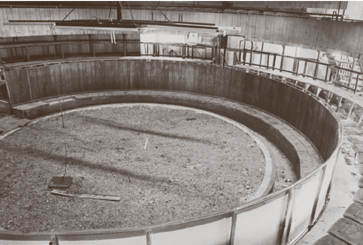
Left: Photo taken in 1999 at Crocodile Lake wildlife refuge of what was once an active cockfighting ring off CR 905. The arena which hosted rooster fights was called the "Chicken Ranch," and it shut down after it was raided sometime in 1987-88.

Few are aware that back in the mid-80s a flourishing illegal cockfighting business was going on in north Key Largo, just off CR 905 about a mile south of the three-way at Card Sound Road. I recall seeing many cars turn off the main road on weekends and drive into the hammocks. At a glance, it didn't look like it was a family picnic. The conversation was loud and exclusively Spanish; there were guards checking all who entered, a few women, but mostly many older Cubans with lots of cash and their bodyguards with lots of guns.