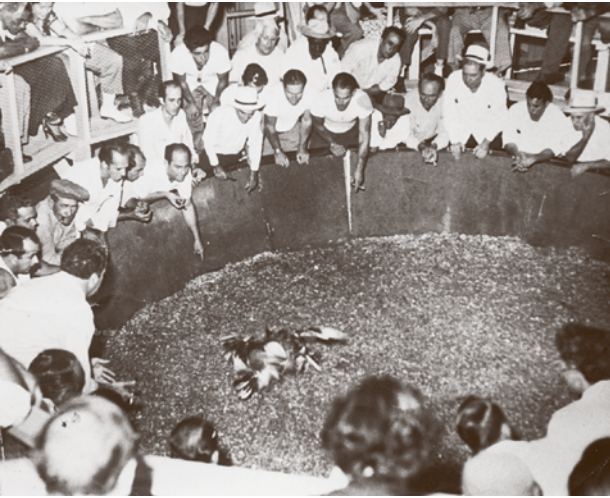
Right: A cock fight.

obviously someone is feeding them. I suppose no-one is particularly bothered by the roosters' early morning crowing. I find them amusing and a small reminder of our early Caribbean island roots.