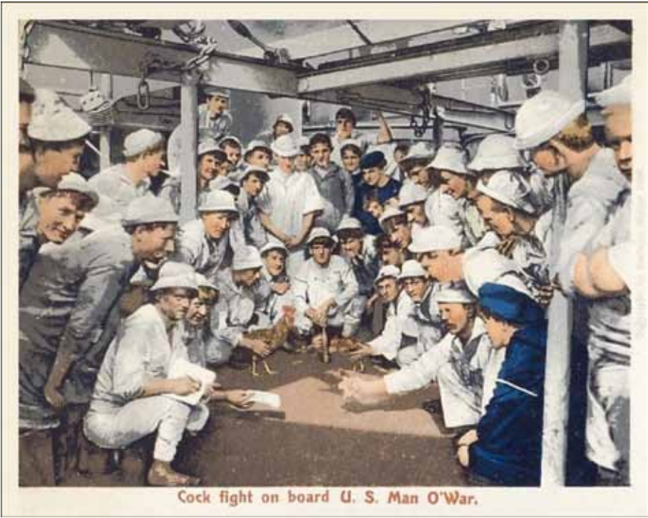
This 1906 postcard of sailors betting on a cockfight depicted everyday life aboard warships during WWI. Color-tinted postcard published by the American News Company, New York.

A 1906 postcard of sailors betting on a cockfight depicted everyday life