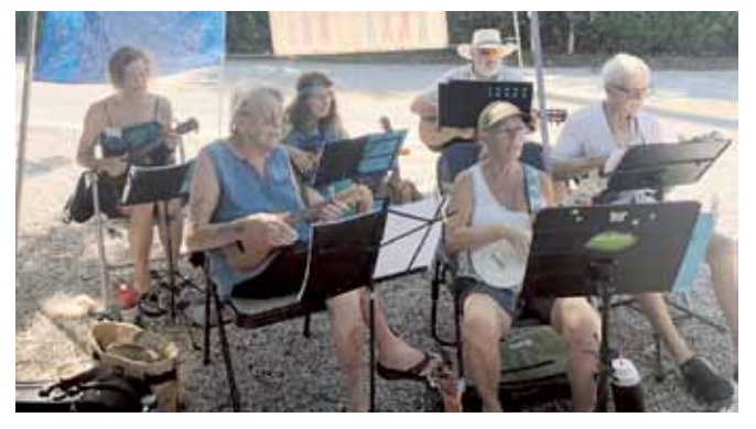
Ukulele JOY, one of the many activities offered by the J.O.Y. Center, (Just Older Youth), plays for customers at the Midway Cafe the first Sunday of every month. Free beginner ukulele classes will be offered Thursdays 12:30-1:30 at the Key Largo Library during the month of September. Come JOYn the fun!