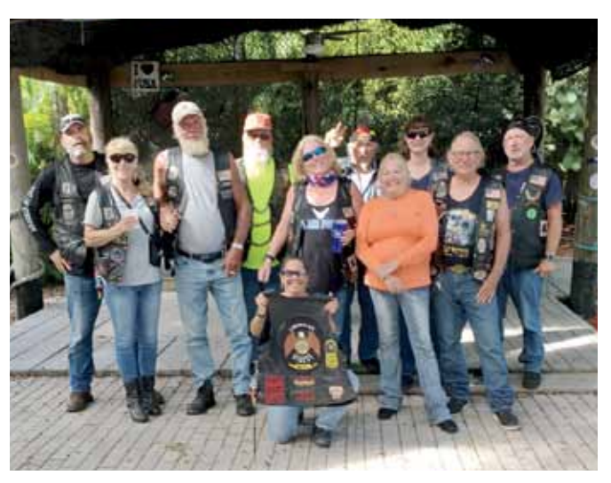
Legion Riders from Tampa stoppped by the American Legion in Key Largo