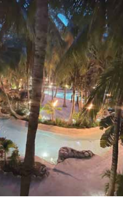
Beautiful Cheeca Lodge