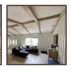
The best team to build your dreams!