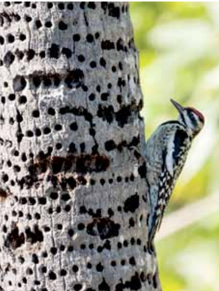
Yellow Bellied Sapsucker probes for insects on a hole riddled coconut palm trunk.

Aside from organized events such as the CBC,