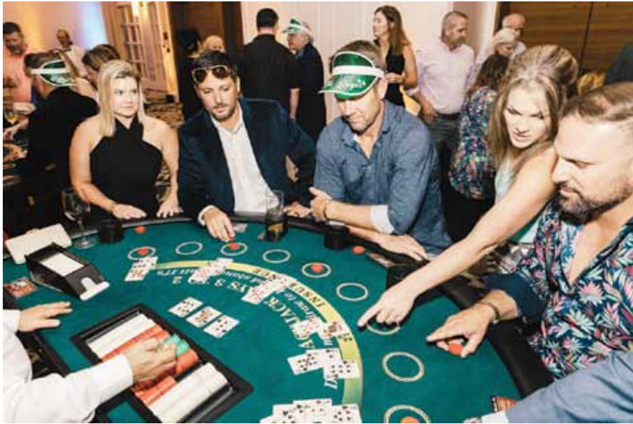
Habitat's 2023's event was a casino-themed evening.

Reprinted from DailyOM - Inspirational thoughts for a happy, healthy and fulfilling day. Register for free at www.dailyom.com