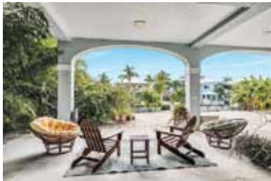
109 Ocean Shores Drive, Key Largo

Unique and stunning - words that only begin to describe this home. If you are looking for a special home in the Keys, this one fits that bill! Custom-built features throughout will not disappoint. The central location is convenient for the boating enthusiast, with quick canal access to the ocean. 3/3 and 1/1 down. A gourmet kitchen with commercial-grade gas stove, double ovens, farmhouse sink from England, beverage fridge, quartzite countertops, and more. Wonderful views from the rooftop. Lush tropical landscaping featuring fishtail and Areca palms create privacy on both sides of the property. Fiddle leaf figs, elephant ears, and Monstera plants adorn throughout the property. Giant Milkweed trees serves as a habitat for monarch butterflies, a Powderpuff tree attracts hummingbirds, plus two garden beds for vegetables and herbs. Also various fruit trees including banana, key lime, and lemon.