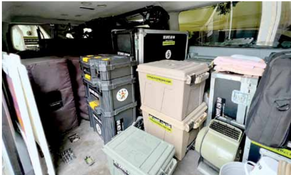
From the high of playing for several hundred people to the agony of trying to dry wet, sandy cables and soggy equipment... the acrid smell of mold and mildew already overtaking the sweet smell of Mary Jane in the van.