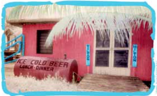
FRED'S TILTON HILTON - DOWNTOWN CARD SOUND ROAD

SPF 50, long sleeve, fishing performance shirt in aluminum, blue mist or white.