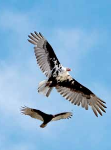
Piebald Turkey Vulture, a genetic mutation where they lose the pigment for feathers and skin.

After finding the bird, raising the camera and getting in focus, I had to act quickly before the bird was gone. I guess that's why I have a lot of photos of birds flying away! The thrill of the hunt!