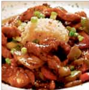
Kung Pao Bowl