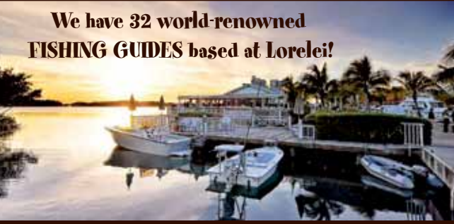
We have 32 world-renowned FISHING GUIDES based at Lorelei!