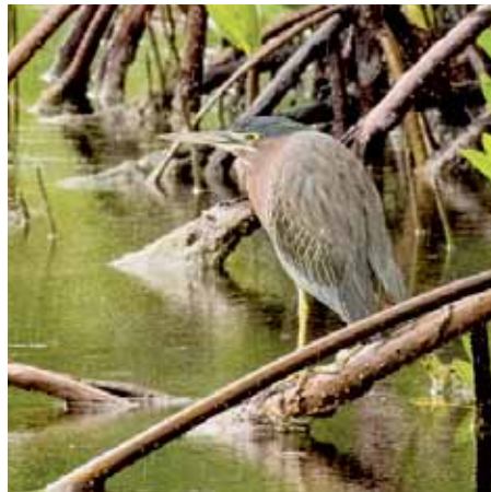
As a novice birder, spotting a Tri-colored heron in its natural environment is exciting.

That's normal, the bird has stopped moving, they assured me, look for the movement of the leaves. That helped, and when finally I saw the bird there would be a celebration.