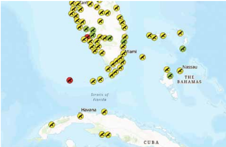
Designated CBC areas In the Florida Keys are Dry Tortugas N.P., Key West, Lower Keys-Key Deer N.W.R., Long Key - Lignumvitae, Key Largo-Plantation Key, and Crocodile Lake NWR.