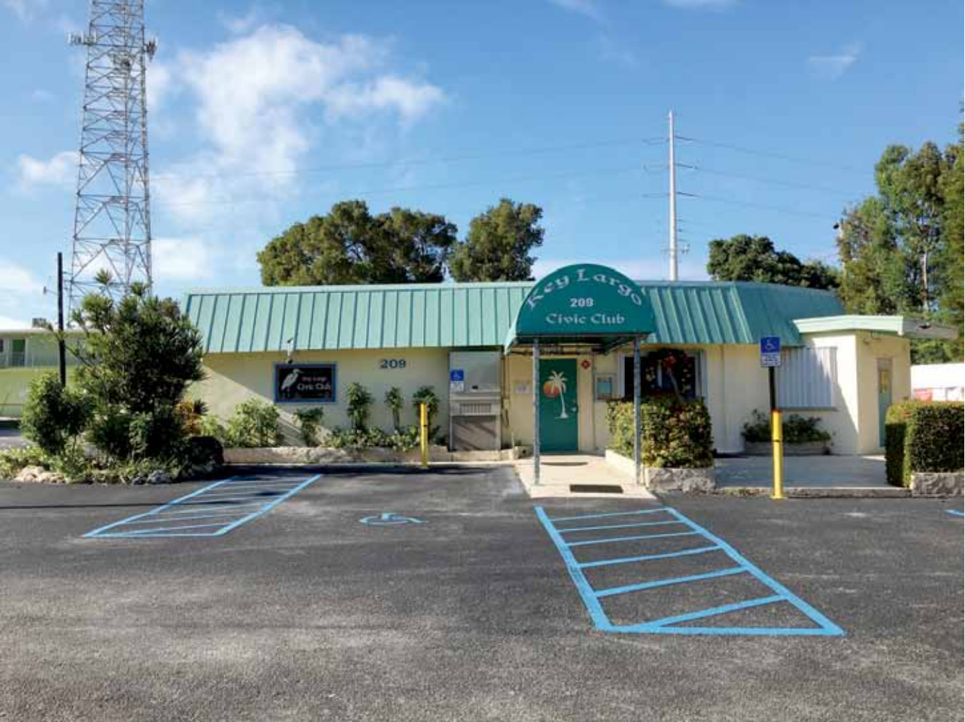
The present-day building is a busy meeting place for all kinds of community activities.

The club sponsored through the Chamber of Commerce, the Key Largo Canal Committee, which envisioned the Key Largo Waterway and saw it through to completion at no