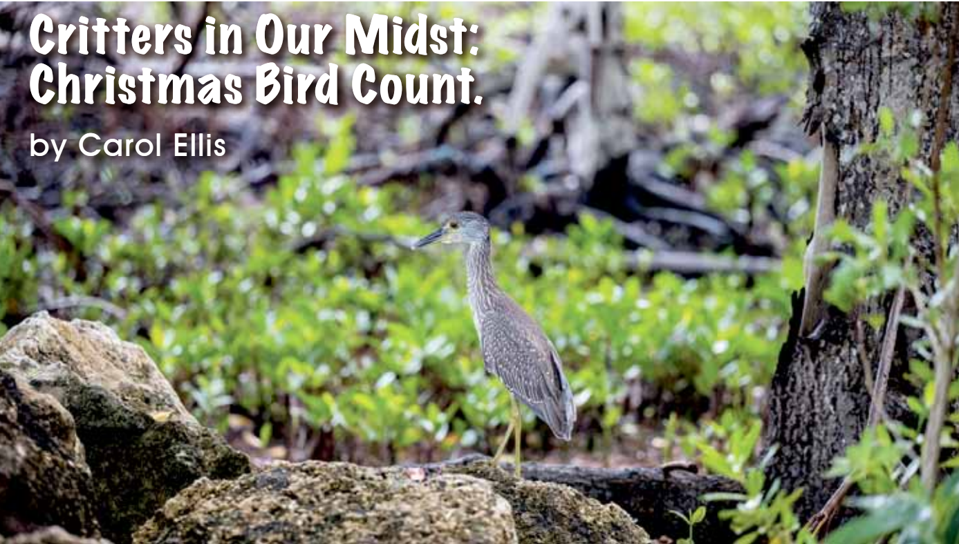
This juvenile Yellow Crowned Night Heron blends in with the mangroves where it lives.

With its cooler, dryer temperatures, winter has finally arrived in the Florida Keys and the time to get out and explore nature is right here and now.