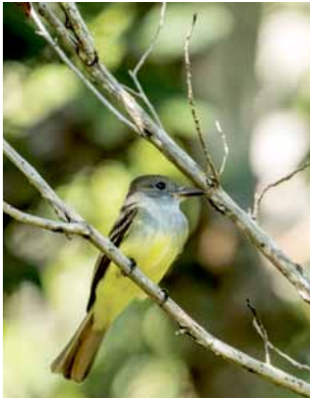
Great Crested Gnatcatcher

Birding is a challenge for sure. Especially if you are not familiar with their calls, have poor hearing or don't know what you are looking at. I can check all of the above boxes! It was hilarious as the group would point out a bird that for the life of me I could not see.