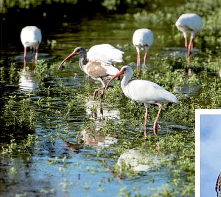
Ibis hang out in puddles formed by recent rains.

time in observation. The weather's great and the birds are here. Grab a friend and take a walk outside at Dagny Johnson Key Largo Hammock Botanical State Park, located on County Road 905, half-mile north of the