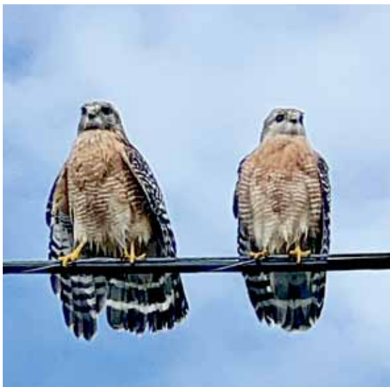
A pair of Red Shouldered Hawks drying out at Dagny Johnson Key Largo Hammock Botanical State Park after almost a week of rain.