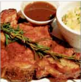
Prime Rib Dinner