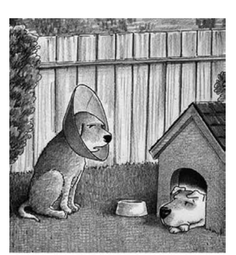
"I have an enormous favor to ask you."