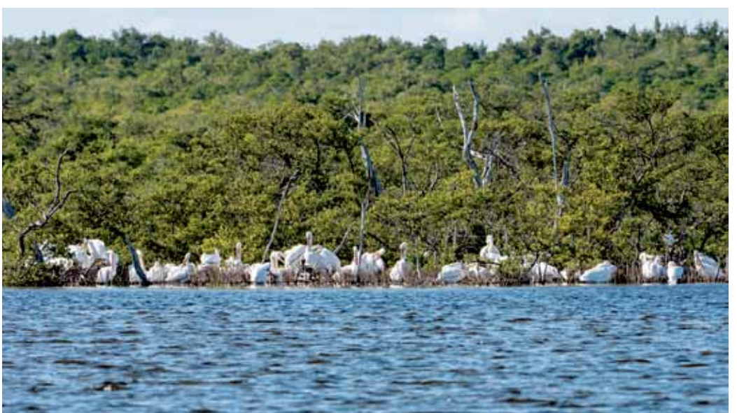
White Pelicans are seen among the snorkel roots of the Black Mangrove, Crocodile Lake National Wildlife refuge.

White Pelican CONTINUED