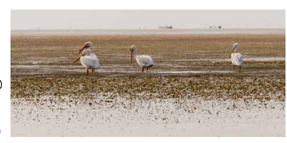
White pelicans wading on a flat in search of food.

Most people are familiar with the Brown Pelican, (Pelecanus occidentalis) who can be seen everywhere all year long in the Keys. While White Pelicans wade in the tidal flats, Brown Pelicans patrol their fishing waters and are seen begging for fish at docks or off bridges. Unfortunately some of these Brown Pelicans eventually swallow fishermen's hooks as the pelican swoops over and swallows the bait, hook and all. If the line is cut the bird flys off to have the line entangled and the bird is left