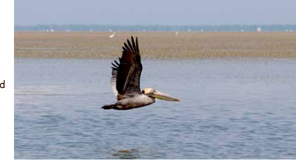
A low flying Brown pelican in the Florida Keys backcountry.

preening, dozing, and soaking up the sunshine, oblivious to my presence 500 ft. away, across the water, from behind a guard rail along the gravel shoulder of Card Sound Road. White Pelicans are tolerant of human observers if not approached too closely.