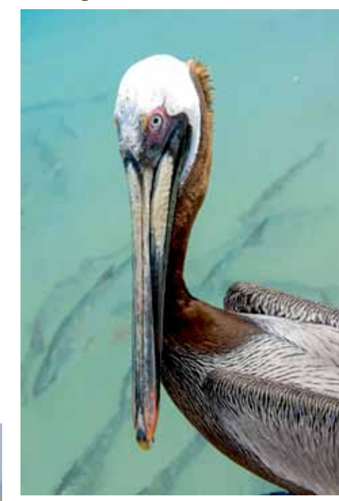
The Brown Pelican can be seen everywhere, all year long, in the Keys; usually juvenile. In the first year they have a brown neck and wings and very white belly; in the second year the body more grey than brown; in the third year, the belly is dark.

Most people are familiar with the Brown Pelican, (Pelecanus occidentalis) who can be seen everywhere all year long in the Keys. While White Pelicans wade in the tidal flats, Brown Pelicans patrol their fishing waters and are seen begging for fish at docks or off bridges. Unfortunately some of these Brown Pelicans eventually swallow fishermen's hooks as the pelican swoops over and swallows the bait, hook and all. If the line is cut the bird flys off to have the line entangled and the bird is left