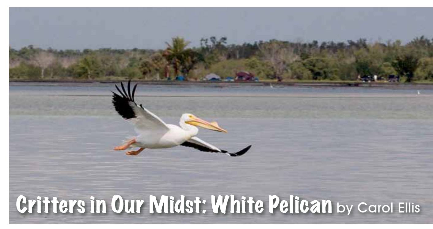
The American White Pelican's wingspan may reach nine and a half feet. Adults have distinctive black wingtips, and their bills, legs and toes are reddish orange or pink.

4 · The Coconut Telegraph · March 2024 March 2024 · The Coconut Telegraph · 5