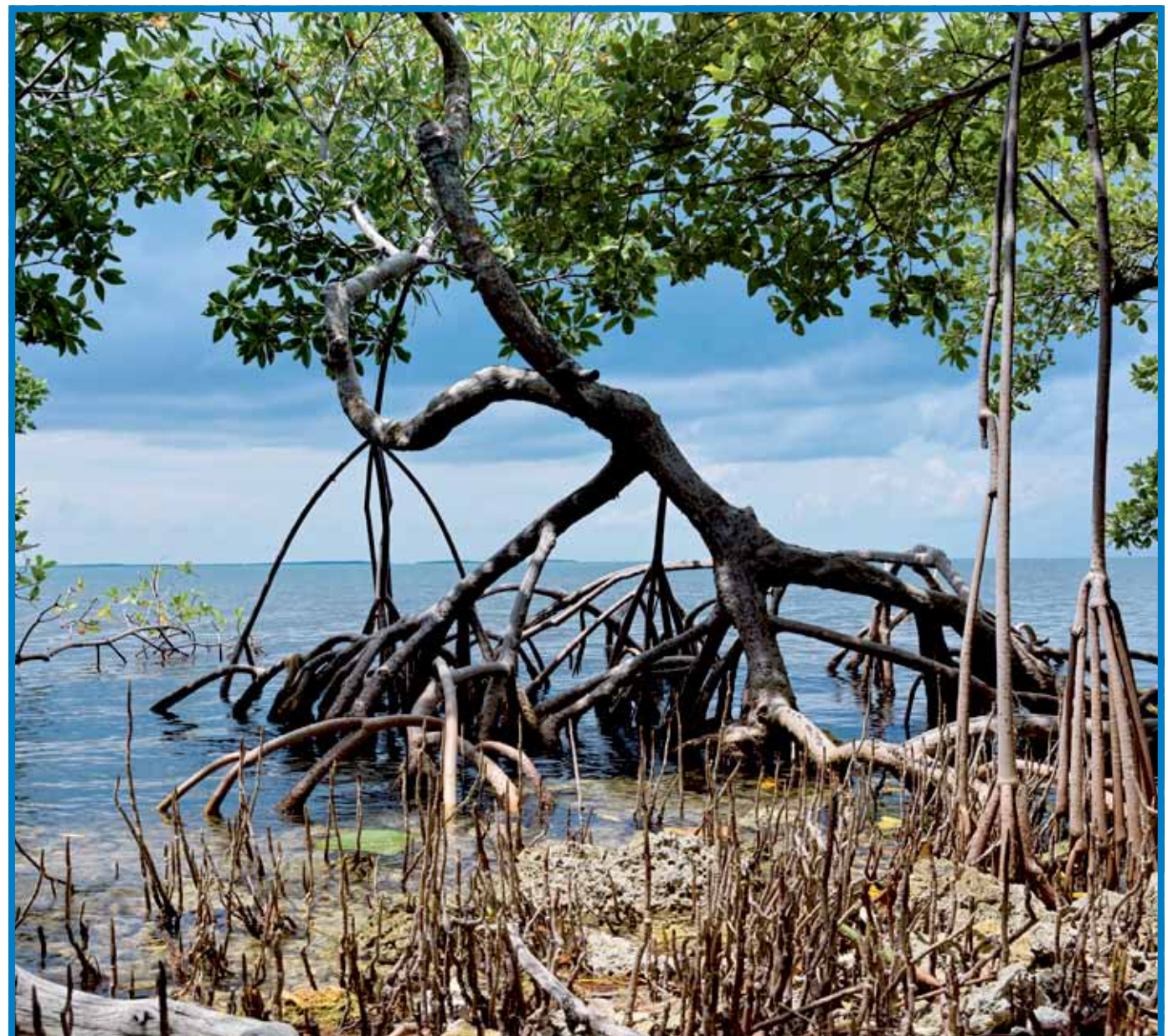
Mangroves are the nursery for the oceans. 75% of the game fish and 90% of the commercial species use mangrove roots and shallow waters to shelter from predators until they reach a size large enough to fend for themselves. The American crocodile lives in the mangroves and bottlenose dolphin feed on their fishes. See her article on pages 4-5 for more about mangroves.

Coco-Nut Funnies Business in the Keys Adopt a Key Largo Shelter Pet Conch Characters