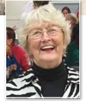
Beloved Monroe County Commissioner Sylvia Murphy in 1954. Photos contributed.