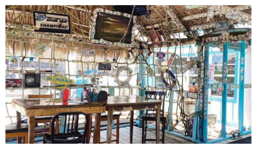
Shipwrecks is a great place to escape the crowds and enjoy great food in an retro Keys-y atmosphere, dine inside or out on the deck.