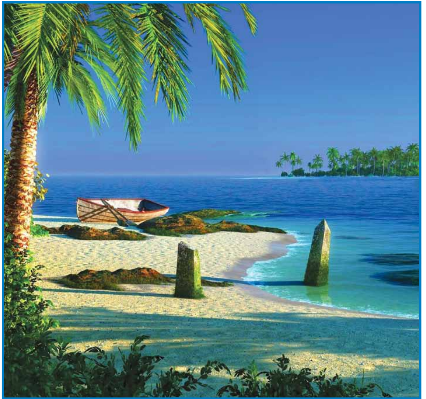
The off-season has begun, bringing us sun-drenched, lazy summer days in the Florida Keys.

Coco-Nut Funnies Business in the Keys Adopt a Key Largo Shelter Pet Conch Characters