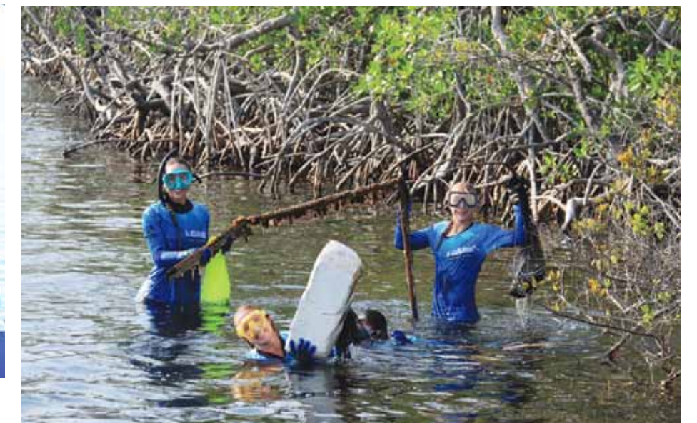
All activities occurred within NOAA Florida Keys National Marine Sanctuary under permits and with FWC authorization.

For the second consecutive year, employees of Dolphins Plus Bayside participated in the ICareTrash Derby.