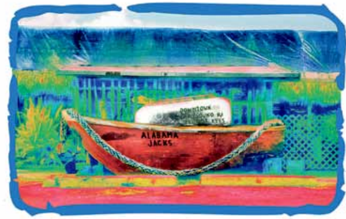
ALABAMA JACKS Downtown Card Sound Road

Today, the park protects approximately 70 nautical square miles of seagrass beds, mangrove forests, and living coral. It serves as a living monument to a man who proved that a pen can be just as effective as a boat in preserving the ocean's wonders.