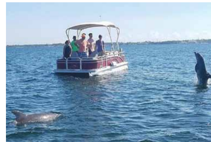
Nothing like dolphin watching out on the water. Catch an unforgettable moment with Pirates Cove Watersports.